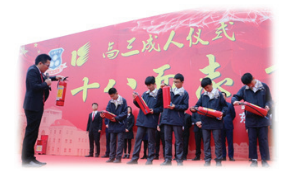
Trainings on fire fighting in school for students