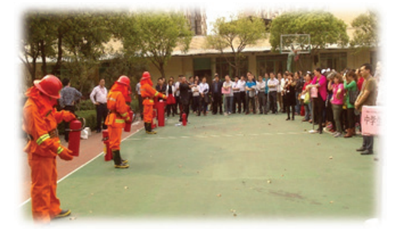
Trainings on fire fighting in school for teachers