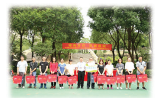
Guangming School's Teacher Fun Games

As classes in our schools have different schedules, we adopt flexible working hour mechanism in Guangming Primary and Secondary Schools for our teachers and staff according to their work and duties. The working hours for teachers and staff shall not exceed 8 hours per day to allow sufficient rest time. Meanwhile, to reduce stress of teachers and staff, create opportunities for them to be acquainted with each other and achieve work-life balance, we regularly organize a variety of activities for teachers and staff in each of our schools. Apart from the celebration activity for Teachers' Day in our Guangzheng Preparatory, Guangming Primary and Secondary Schools also organise volunteer activities, yoga, sports and cultural weeks, singing competitions, dance networking activities, etc. In addition, we provide a special bonus for certain statutory holidays to enhance teachers and staff's sense of belonging to the Group.